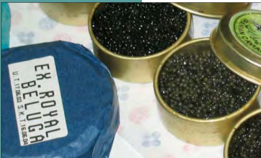
Beluga caviar can fetch retail prices of up to EUR 600 per 100 g.

It is therefore essential that everyone involved in the trade and marketing of caviar (including importers, exporters, wholesalers, retailers, restaurants and travel businesses, such as cruise ship operators, airlines and luxury hotels) are aware of the labelling requirements so that all can adequately implement and comply with the new