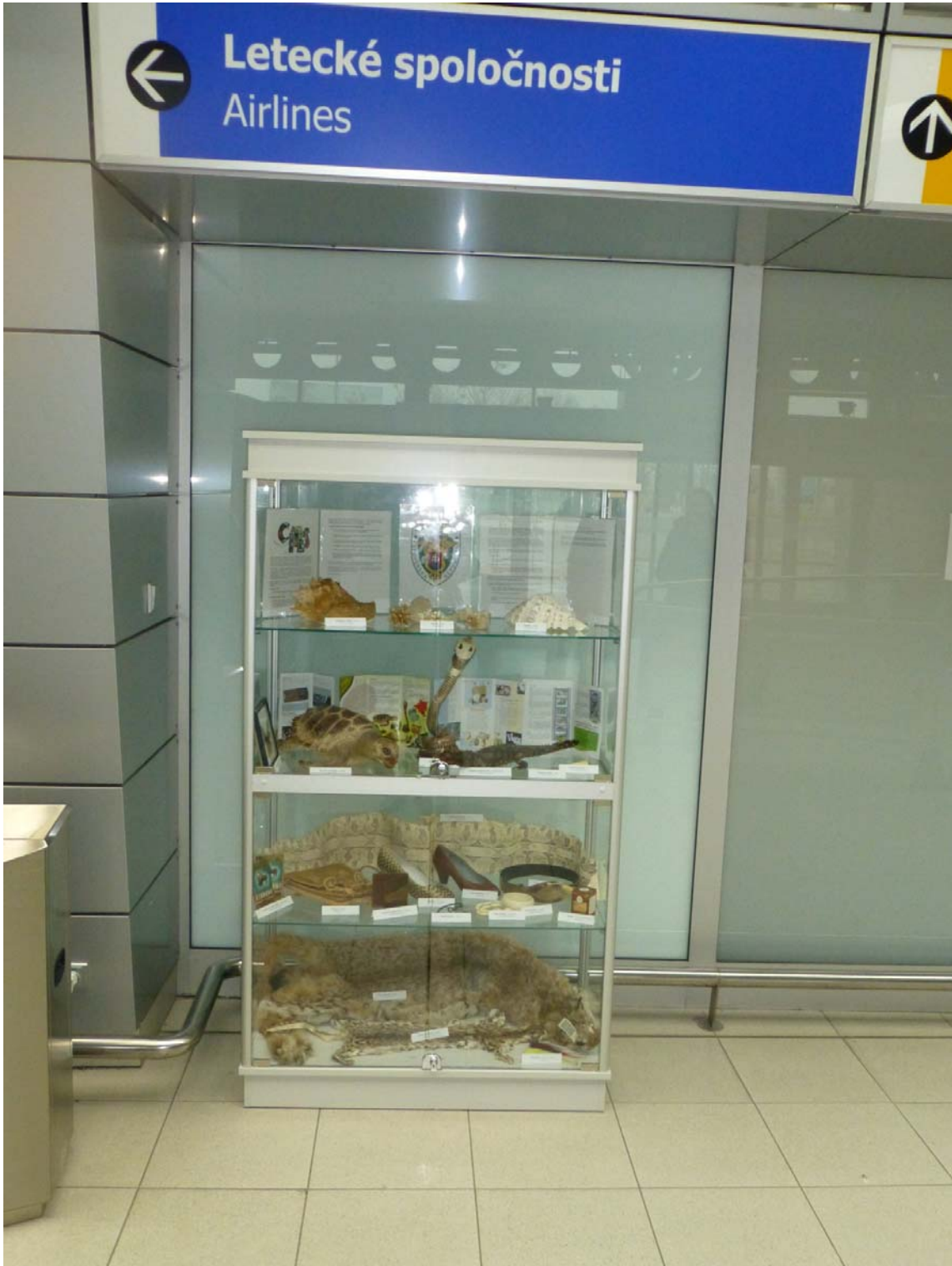
CITES information showcase at the Bratislava Airport