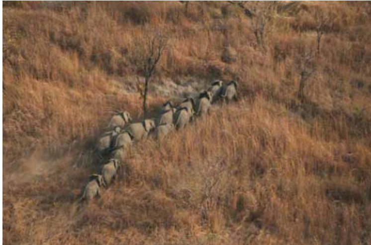
The only elephant group sighted in SNP during the survey (Fay, et al., 2007.)

The second survey (Grossman, et al., 2008) covered the proposed Bandingalo National Park, the Nimule National Park, the Kidepo Reserve and the Loelle area. In Nimule National Park 69 elephants were observed. The survey also confirmed the seasonal use by elephants of the Loelle area (a proposed protected area), which may form part of a transboundary population between Southern Sudan, Ethiopia, and Kenya. Some elephant tracks were observed in the Bandigalo area and in the Kidepo Reserve, which is contiguous with the Kidepo National Park on the Ugandan side. Wet season counts should be carried out to better understand the seasonal distribution of elephants across these landscapes (Grossman, et al., 2008).