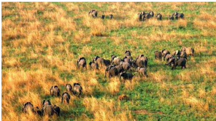
Elephants in Akagera National Park.

A 2006 dung count estimated the elephant population in the Akagera National Park to be 28 (Parker, 2006).