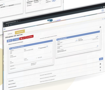
Electronic application form