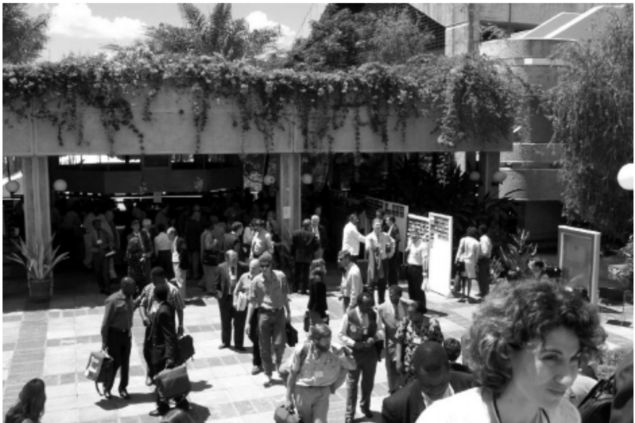
Between sessions the discussions continued