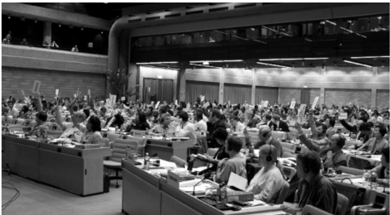
Vote during Committee I