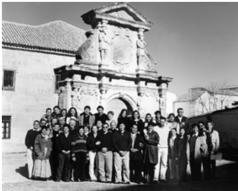
Second master course: participants

topics that are necessary for CITES to be properly implemented. The practical training took place at the Botanic Garden/University of Cordoba, the Barcelona Zoo, the Jerez Zoo, the Customs Office of Algeciras, the Cazorla Natural Park, Doñana National Park and the University of Granada. All students passed the final exam and they are preparing their thesis in their respective countries.