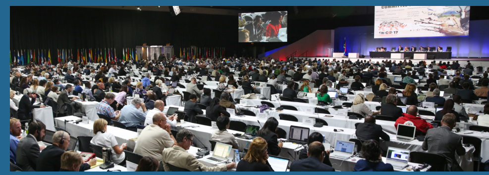
CITES CoP17, Johannesburg, October 201

CITES regulates international trade in specimens of species of wild fauna and flora based on a system of permits and certificates issued under certain conditions. It covers export, re-export, import and landing from the high seas of live and dead animals and plants and their parts and derivatives.