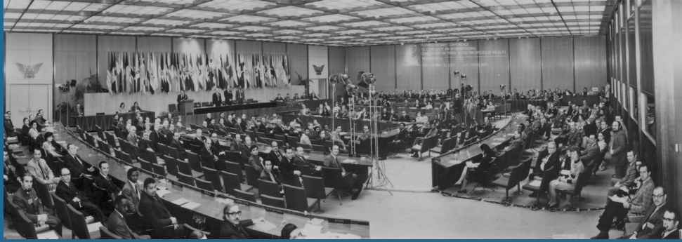
CITES Plenipotentiary Conference, Washington, D.C., March 1973

The Convention on International Trade in Endangered Species of Wild Fauna and Flora, known as CITES or the Washington Convention, was signed in Washington, D.C., the United States of America, on 3 March 1973 and entered into force on 1 July 1975. Today almost all countries in the world are Parties to this international legally binding agreement.