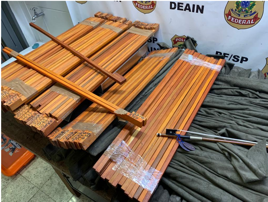
Figure 5 - 120 bow blanks and 114 bows without any documentation of origin, caught in a smuggling operation being transported in suitcases to England by a famous Brazilian bow maker arrested at the Guarulhos (SP) airport in April 2022.