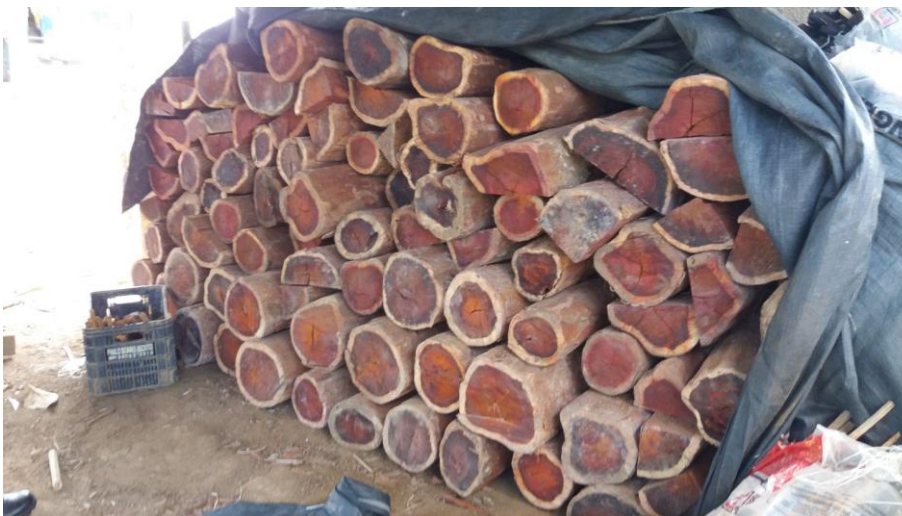
Figure 3 - 102 logs of illegally sourced Brazilwood hidden in world-famous archetier's rural property, seized in Aracruz (ES) during Operation Dó-Ré-Mi in 2019.