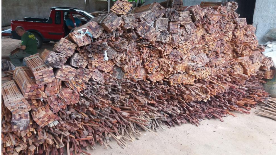
Figure 4 - 20,747 illegally sourced bow blanks hidden at rural properties in João Neiva (ES), seized during Operation Dó-Ré-Mi in 2018.