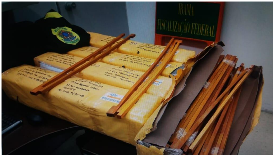
Figure 2 - 400 bow blanks of illegal origin forwarded by the Post Office to France, seized at Guarulhos (SP) airport in 2017.

Even with all the efforts undertaken by IBAMA and the Federal Police, in recent months, new loads of bow blanks and bows have been caught being smuggled through Brazilian airports, shipped as packages or carried by the bow makers themselves in their checked luggages and carry-on bags on trips abroad.