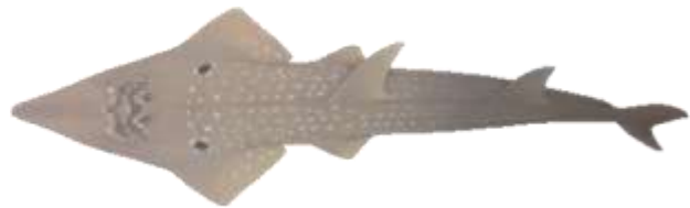
Figure 2: Rhynchobatus djiddensis . From Last et al 2016.