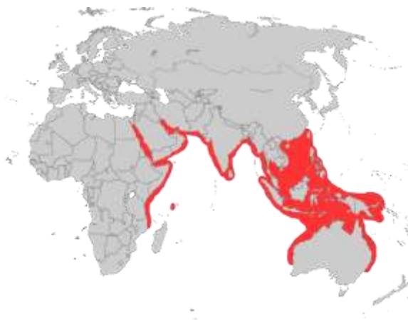
Figure 3: Distribution of R. australiae (Last et al. 2016)

Rhynchobatus djiddensis is found in the Western Indian Ocean, from South Africa to Oman. R. australiae 's range overlaps with that of R. djiddensis , and also extends into South Asia, South East Asia and Oceania, (Last et al. 2016; Giles et al. 2016). Similarities between these species have made identification difficult (Jabado et al. 2017), and their respective ranges were only defined in 2016 (Last et al. 2016).