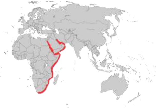
Figure 4: Distribution of R. djiddensis (Last et al. 2016)