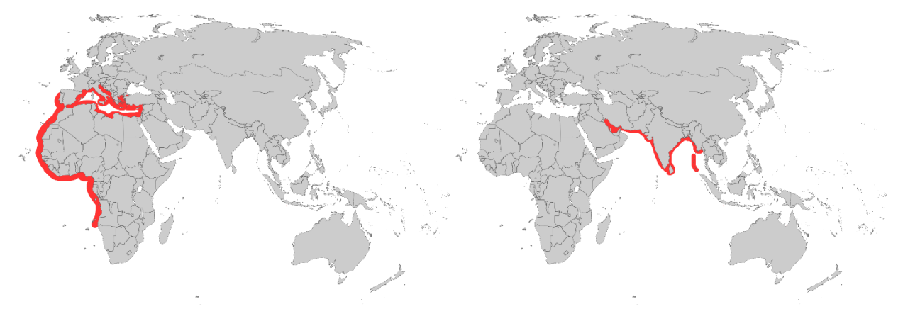
Figure 3. Distribution of blackchin guitarfish Glaucostegus cemiculus (IUCN, 2018)

Glaucostegus granulatus are found in the north western Indian Ocean, from the United Arab Emirates (including the Arabian/Persian Gulf) to Myanmar. Specimens of Glaucostegus typus are often misidentified as G. granulatus , leading to reports of the latter's range extending further than this, but such a range extension is unlikely (Marshall & Last, 2016).