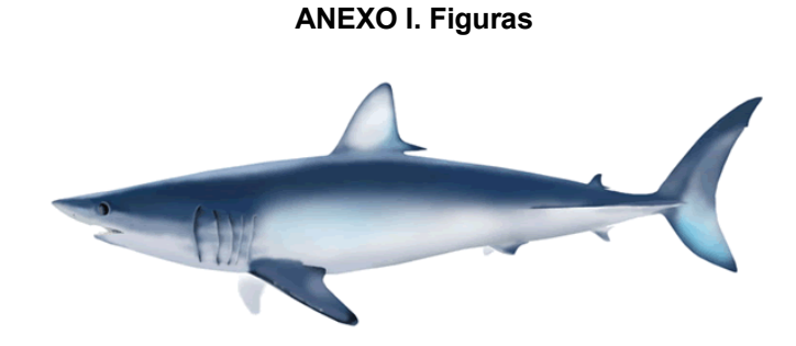
Figura 1. Tiburón Mako de aleta corta ( Isurus oxyrinchus ).