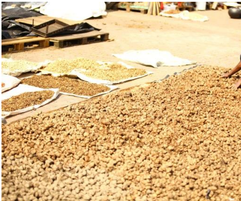
Figure 3: Siphonochilus aethiopicus tubers being dried at a traditional medicines market in Johannesburg, South Africa after they were off-loaded by a bulk trader from Zimbabwe. These tubers were wild harvested in Zimbabwe for “informal” export to South Africa.

Based on over a century of field observation, plus recent quantitative assessments of decline in S. aethiopicus populations in South Africa, there is little doubt that the cross-border trade in S. aethiopicus rhizomes from Swaziland and Zimbabwe to South Africa will contribute to continued population declines in both of those countries. In addition, localized and unsustainable depletion of S. aethiopicus populations may be occurring in southern Mozambique, also due to trade to South African traditional medicine markets. The extirpation of the species across its range in KwaZulu-Natal is attributed to harvesting for traditional medicine (local consumption and domestic trade in muthi markets), and the drastic declines in the remaining populations in the South African provinces of Limpopo and Mpumalanga are also attributed to harvesting for the traditional medicine trade. The demand for the species appears to be such that cultivated sources cannot supply the urban demand, hence plants are sourced from neighbouring countries – but the impact in these countries has not been fully assessed. One visit to a South African traditional medicine market in 2011 revealed thousands of plants harvested in Zimbabwe – which must have resulted in the extirpation (or near-extirpation) of that population at the harvesting source (Figure 3).