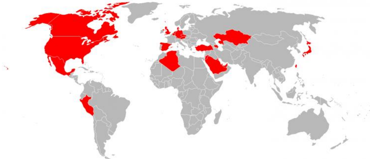
Figure 1. World map showing countries with at least 1% of global export or import of peregrine falcon from 2010-2014 (dark red shading). Together these countries account for 95% of exports and 96% of imports.

Peregrine falcons occur in over 200 countries and territories according to Species+. However, although the species is globally distributed, international trade is not. Over 95% of the trade occurs among the 24 countries shown in Figure 1.