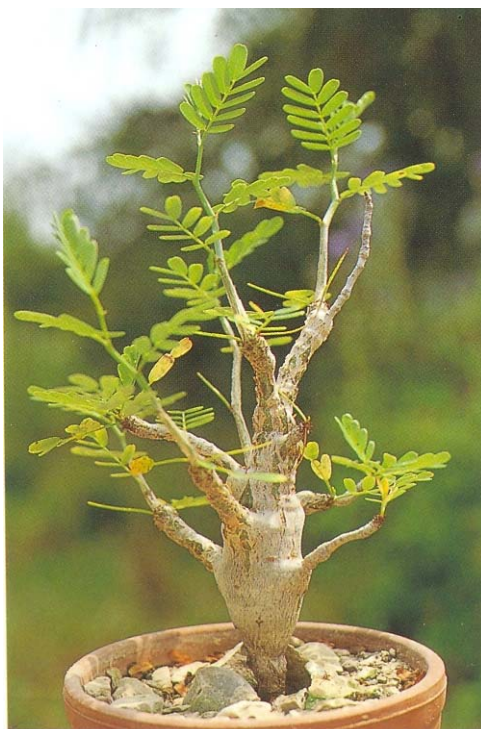
Photo: Senna meridionalis , cultivated