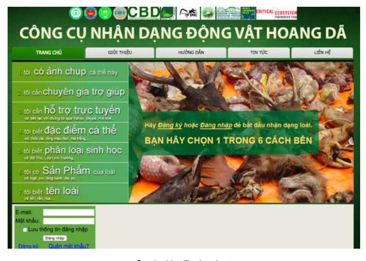
Species identification sheet