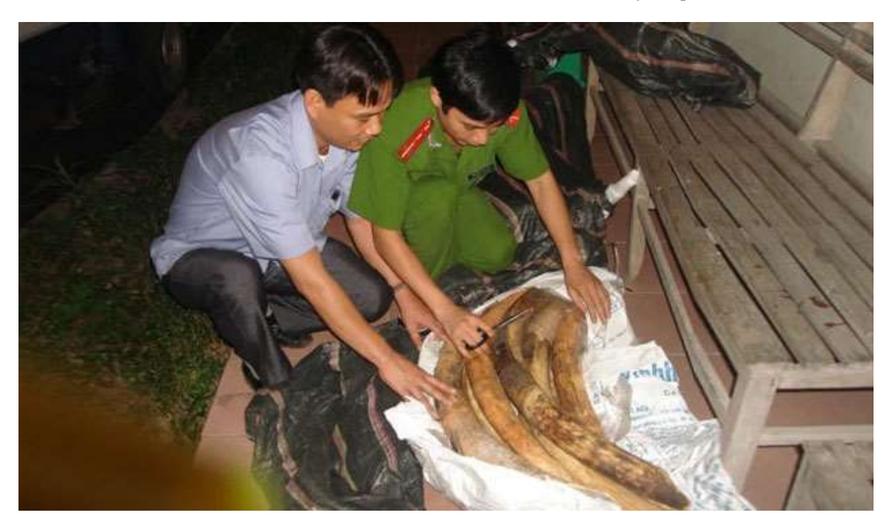
A ivory seize case made in Mong Cai (near china border) by environmental police