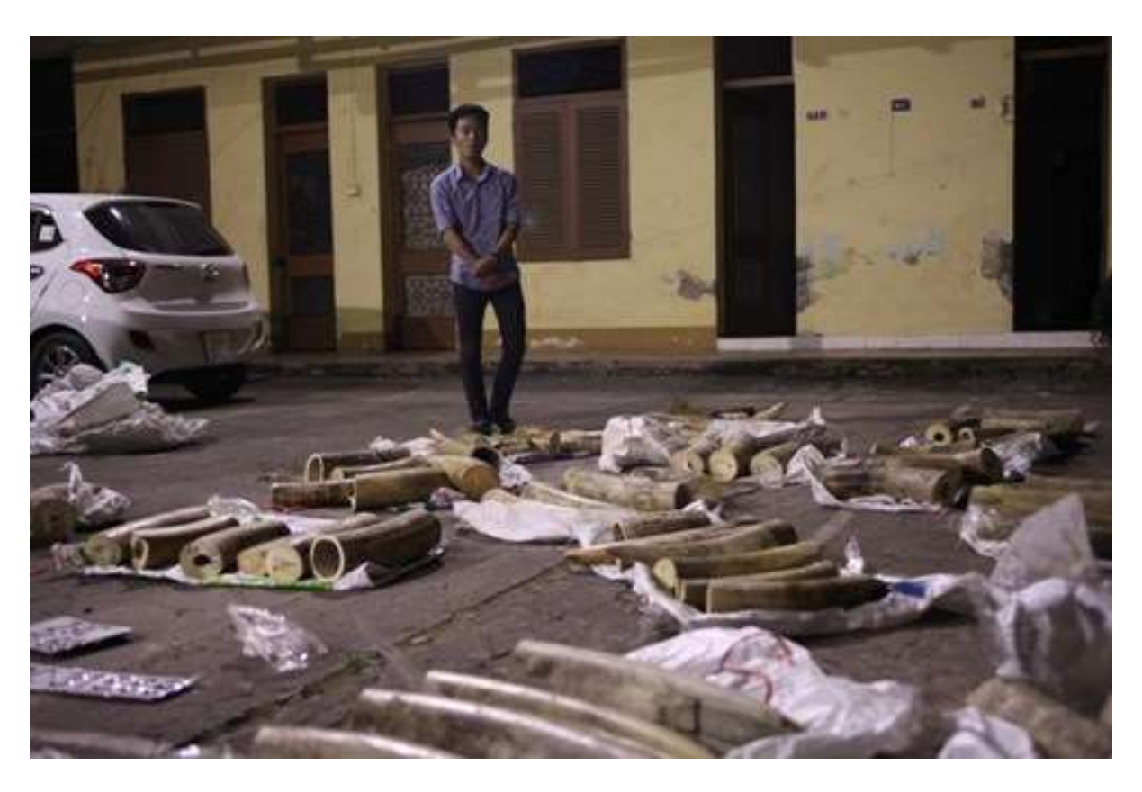
500kg of Ivory seized by Traffic police in Bac Giang Province, in May 2016