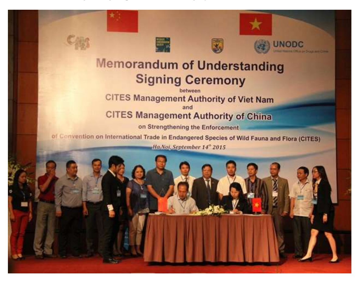
CATEGORY 4: Strengthening cooperation and sharing information

MOU between Viet Nam CITES MA and China CITES MA signed in Hanoi in September 2015