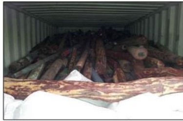
Red Sanders seized ( Pterocarpus santalinus ) at North Port, Port Klang, Malaysia