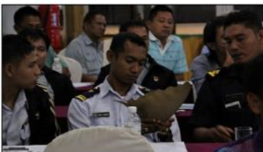
Species Identification For Sharks and Manta Rays Under CITES Course (DoFS)