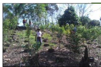
Technical audit activities for registration of Agarwood Plantation at Sabah, Malaysia