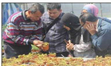
The Identification of Scheduled Flora Species Under CITES Course (DoA)