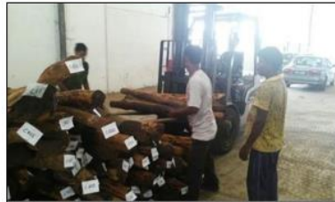
Seized Timber Marking activities