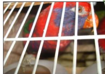
Lorikket seized in Animal Hotel, KLIA , Malaysia