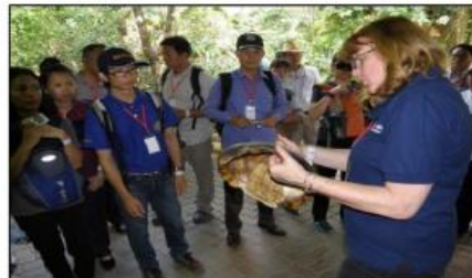
ESABII Trainers (ToT) on CITES Policies and Identification of Threatened Species