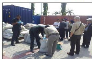
Collaboration with detecting enforcement agency Royal Malaysian Custom with MTIB and Department of Wildlife & National Parks on confiscation of CITES listed species.