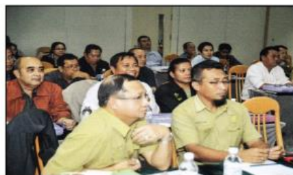
Introduction to Species Identification For Endangered Species under CITES