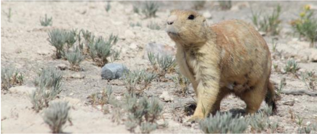
Figure 2. Female Cynomys mexicanus . Photograph by Horacio V. Bárcenas, municipality of Vanegas, in San Luis Potosí, Mexico (2019).