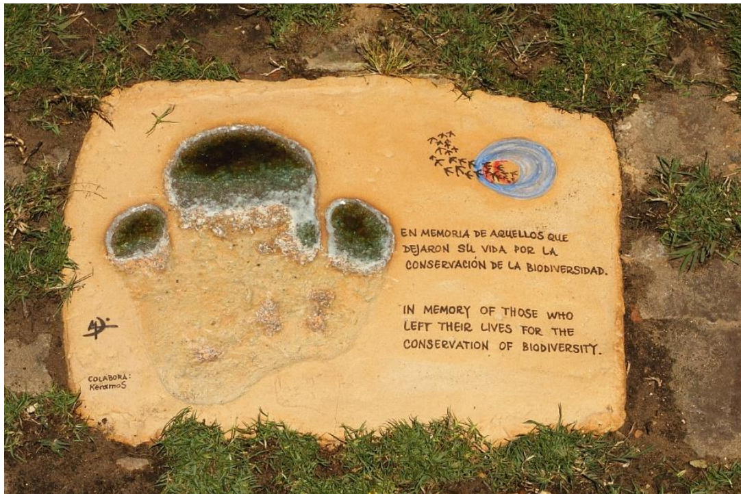
Plaque at Marismillas Palace in memory of those who gave their lives for the conservation of biodiversity