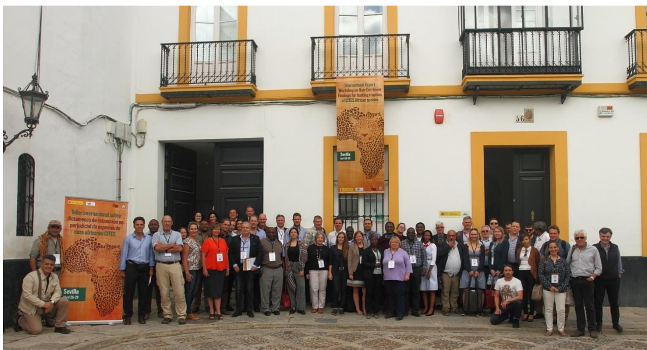
Participants attending the workshop

https://www.dropbox.com/sh/ojve8xwz53sl7ik/AADGpt80_E1hhBENOWV2K7DGA?dl=0