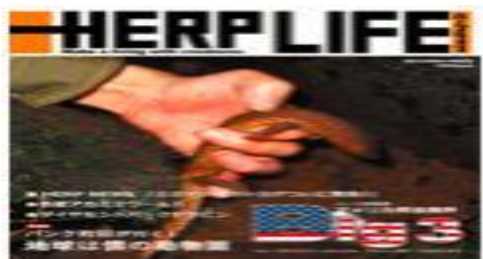
Image 5. Japan Herplife Magazine featuring Lanthanotus borneensis in 2012.

In 2012, a picture of a living Earless Monitor held in someone’s hand featured on the cover of issue 23 of the Japanese reptile magazine HerpLife (Image 5). The article describes how an expedition team working for the magazine found a specimen in Borneo on November 26 2012 and took photographs, one of which was the cover image.