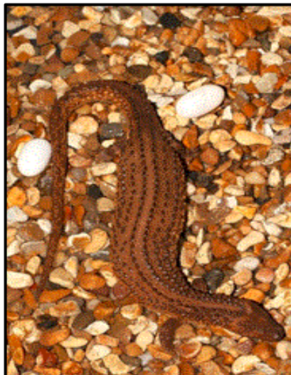
Image 4: Lanthanotus borneensis first reported offspring hatched in captivity, Japan, 2014

In 2014 a Japanese zoo claimed to have successfully hatched ten eggs in captivity confirming the species to be oviparous (Image 4).