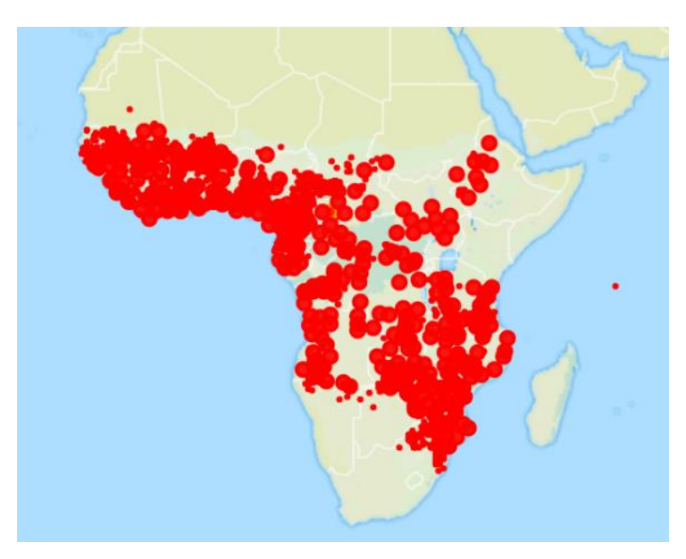
Fig. 1- Natural distribution map of all African Pterocarpus taxa (Pterocarpus Jacq.; CJBG, 2020).

Natural ranges of P. rotundifolius and P. lucens subsp. antunesii do partially overlap.