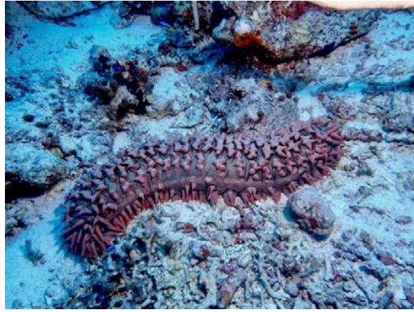
T. ananas (live) iNaturalist