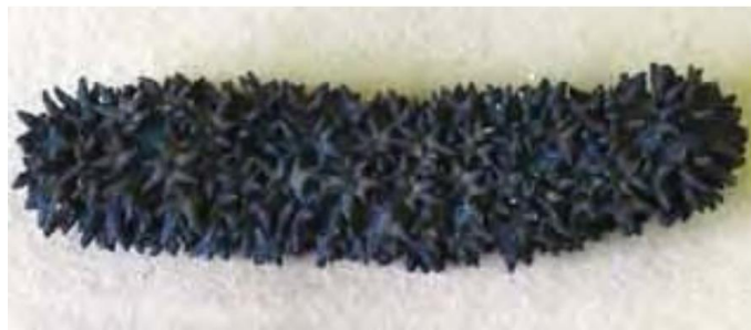
T. ananas (processed)

T. anax is also large, with an average length of 63 cm but a maximum length of 89 cm (Purcell et al., 2012). Its colour varies from creamy white beige to grey or light brown with dark brown and/or reddish spots and blotches dorsally. Those in the Indian Ocean may lack the reddish blotches.