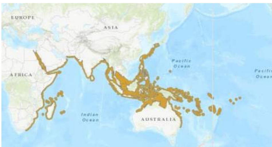
Distribution of T. ananas , IUCN (2012). The IUCN Red List of Threatened Species. Version 2020-2

Thelenota ananas is widely distributed throughout the Indo-Pacific, excluding Hawaii. It occurs in Australia, Bangladesh, Brunei Darussalam, Cambodia, China, Cocos (Keeling) Islands, Comoros, Cook Islands, Djibouti, Egypt, Eritrea, Fiji, French Polynesia, Guam, India, Indonesia, Islamic Republic of Iran, Israel, Japan, Jordan, Kenya, Kiribati, Madagascar, Malaysia, Maldives, Marshall Islands, Mauritius, Mayotte, Mozambique, Myanmar, New Caledonia, Niue, Oman, Pakistan, Palau, Papua New Guinea, Philippines, Réunion, Samoa, Saudi Arabia, Seychelles, Singapore, Solomon Islands, Somalia, South Africa, Sri Lanka, Sudan, Taiwan Province of China, United Republic of Tanzania, Thailand, Tonga, Tuvalu, United States of America (Northern Marianas Islands), Vanuatu, Viet Nam and Yemen (Conand et al., 2013a; Kinch et al., 2008).