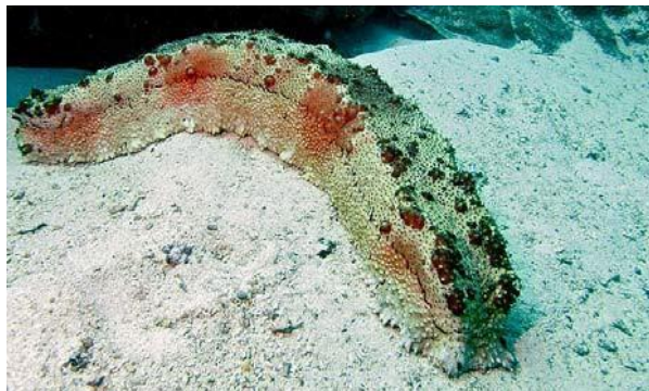
T. anax (live)

In its dried form, T. anax is 15-20 cm long, relatively elongate with a squarish cross-section, and brown in color. The dorsal surface is rough and covered with wart-like bumps. The ventral surface is grainy (Purcell et al., 2012).