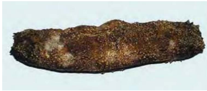
T. anax (processed)

T. rubralineata is also a relatively large sea cucumber, with an average length of 30-50 cm (Purcell et al., 2012). The species' appearance is striking: it is whitish with a complex pattern of crimson lines in a maze-like arrangement. Dorsally, the species has two rows of 13-15 large, conical, fleshy protuberances with pointed papillae at the ends, with yellowish brown tips. The body is roughly square or trapezoid in transverse section, and the posterior part of the body tapers slightly. The ventral surface is flattened and has numerous greenish-yellow or brownish-yellow podia scattered randomly. The mouth is ventral with 20 dull-red tentacles. For ossicles, the species has tentacles with only rods, which can be spiny or smooth, straight or curved, 10-150 \mu\text{m} long (Purcell et al., 2012).