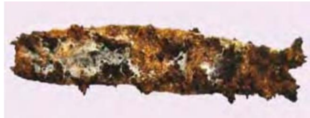
Live T. rubralineata (left) Processed T. rubralineata (right)