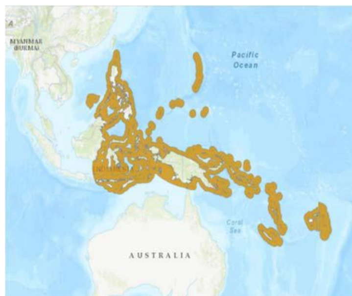
Distribution of T. rubralineata , IUCN, 2013. The IUCN Red List of Threatened Species. Version 2020-2

Thelenota rubralineata is found only in the east Pacific; it has not been identified in the Indian Ocean (Kinch., 2005; Lane, 2008), unlike the other two Thelenota species. T. rubralineata 's range includes Australia, China, Cook Islands, Fiji, Guam, Indonesia, Malaysia, Federated States of Micronesia, New Caledonia, Palau, Papua New Guinea, Philippines, Solomon Islands, Taiwan Province of China, Timor-Leste, United States of America (Northern Mariana Islands) and Vanuatu (Conand et al., 2013b).