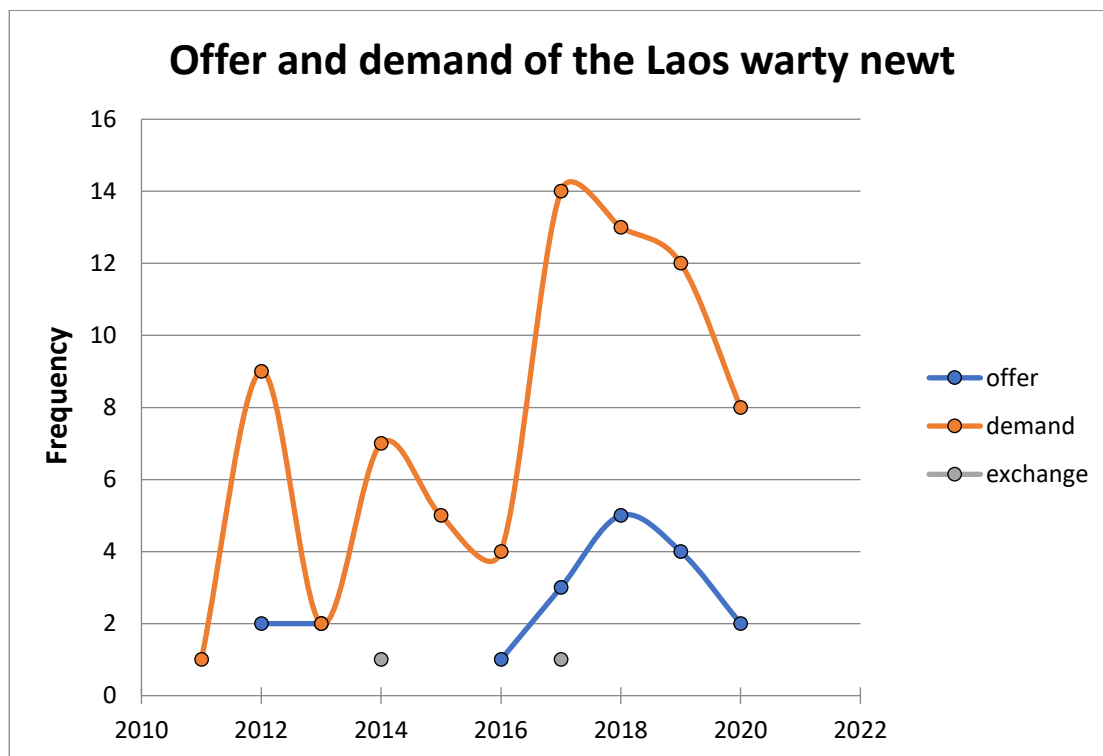
Figure 5. Offer and demand tendencies for Laotriton laoensis based on data from Table 1 for a period between 2011 and 2020.