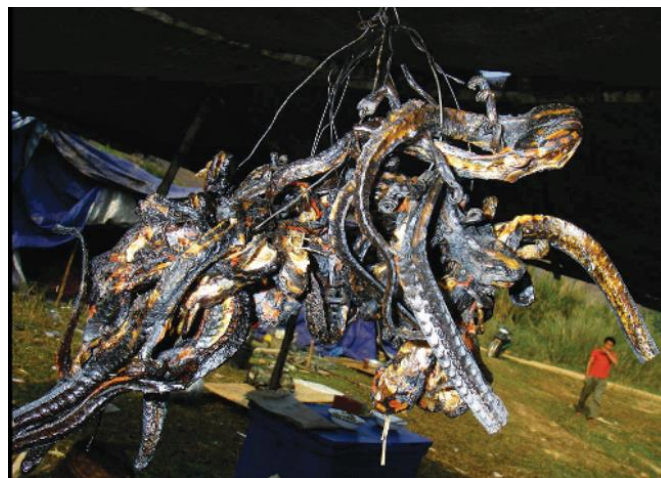
Figure 2. Laotriton laoensis dried over a fire to remove skin toxins before consumption at a road construction camp near Nam Madao (25 February 2009)