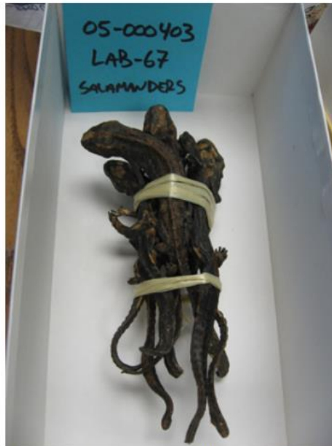
Desiccated Asian salamander.

We caught her as she came through the Minneapolis-St. Paul Airport. US Customs and Agriculture found her during what is called a secondary inspection. Anyone who's traveled internationally, odds are, if you haven't had a secondary inspection yourself, you've seen someone else go through it. They pull you aside, open up your suitcases and physically check to see what your bringing back into the United States as compared with what it says on your Customs declaration.