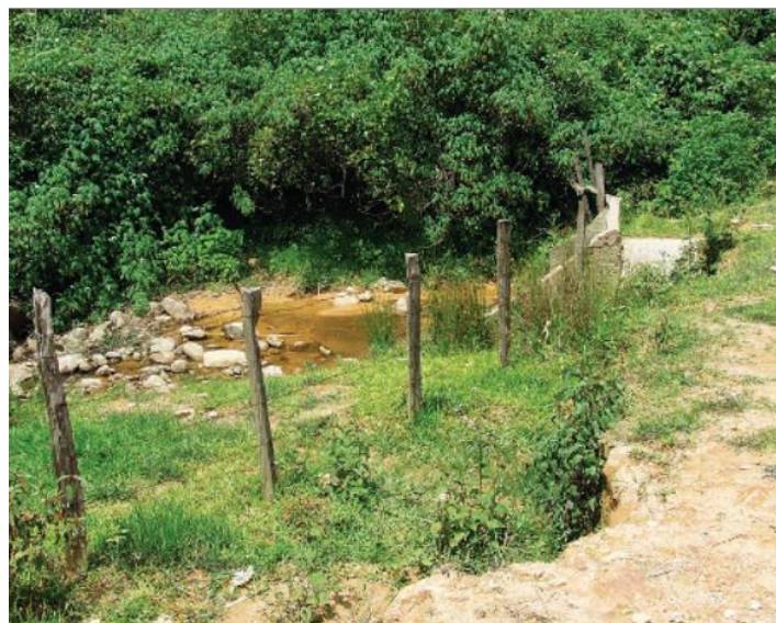
Figure 3. A road culvert over a stream in Xaysamboun, Vientiane, where during the day specimens of Laotriton laoensis could be seen inside the water from the road (8 June 2007).