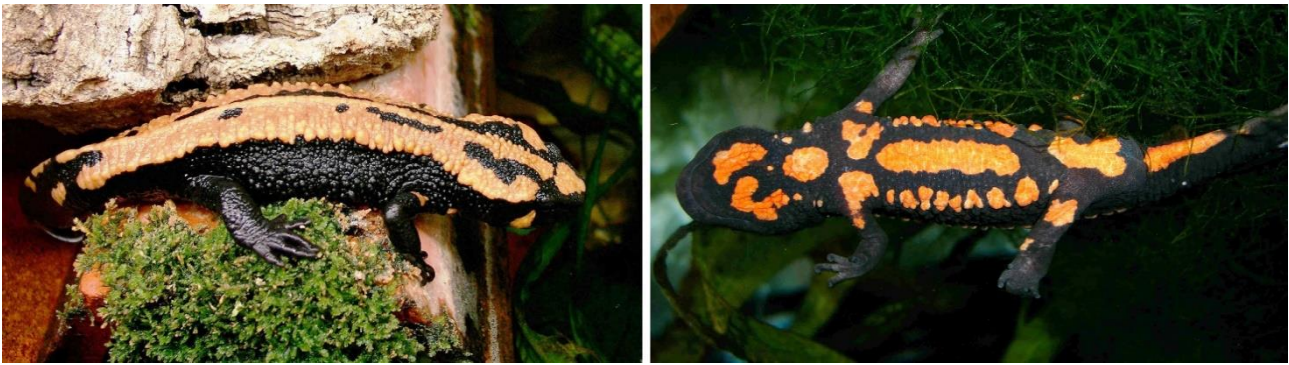
Figure 1. Laotriton laoensis adult from Phoukout District, Xiangkhouang Province, Lao PDR.