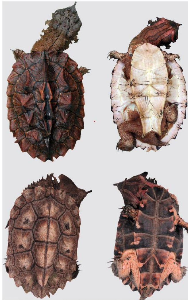
Figure 3. Source: Comparison of the dorsal and ventral appearance of Chelus orinocensis (top), subadult female, and Chelus fimbriata (bottom), subadult female (Vargas-Ramírez et al. 2020)

Although both species can reach the same size, up to 50 cm, they live in different territories and the distinctive physical characteristics of each species are based on the colour of the plastron and the dorsal area and the colour and shape of the carapace.