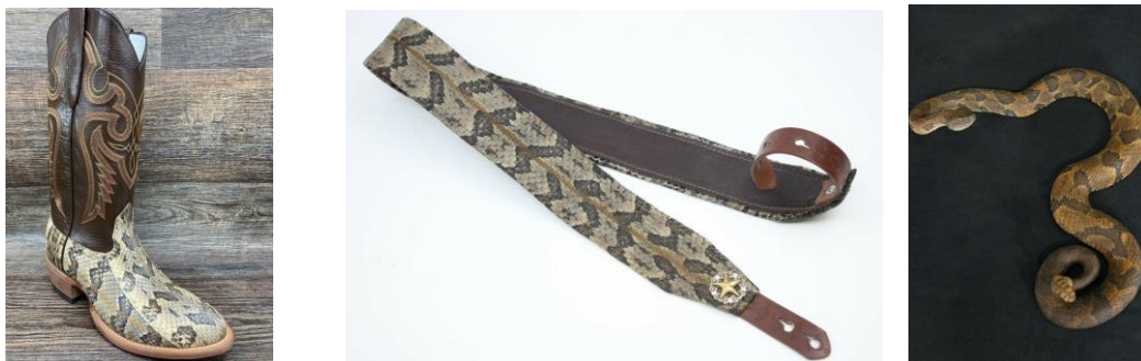
Figure 3. Examples of C. horridus products in online US trade (eBay). Item prices in USD from left to right as of May 2022 are: $319.95 (shoe), $649.99 (guitar strap), and $795.00 (taxidermy).

Domestic commercial use of C. horridus is observed in the live pet trade, skin trade, venom trade, in rattlesnake roundups, and for sale as "novelty" items (e.g., taxidermy, rattle jewelry). Live C. horridus are also still used by Christian "serpent handling" churches in Appalachia (Duin 2021). Historically, the availability of live individuals has been driven by the popularity of rattlesnake roundups, hunts, and shows (Fitzgerald and Painter 2000). Snakes are purchased at these events for resale into the commercial market (Fitzgerald and Painter 2000). Though largely considered an antiquated practice, rattlesnake hunts and roundups in which it is not required to return the snakes to the wild are still practiced in Texas ( http://www.rattlesnakeroundup.net/ ), Oklahoma, Georgia, and Alabama (see Table 2). The species is readily available for purchase online with no information regarding the origin of the snake for as much as 250 USD (Underground Reptiles 2022).