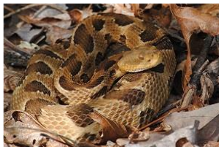
Figure 1. A timber rattlesnake ( Crotalus horridus ) in Florida.