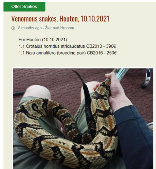
Figure 4. A screenshot of a Slovak citizen selling a timber rattlesnake on a German pet trading website ( www.terrarium.com ) for 408.91 USD.

(Adams 1994). In addition, commercial traders in the 1980s and 1990s were reluctant to discuss their harvest numbers or dealings (Fitzgerald and Painter 2000). From 2013 to 2019, United States Fish and Wildlife Service Law Enforcement Management Information System (USFWS LEMIS) export data reported almost all live (n = 15) legal trade of C. horridus was from captive bred individuals (~89%); however, 100% of C. horridus specimens [not necessarily live, can be parts/products for commercial, scientific or medical use] (n = 20) exported from the US were reportedly taken from the wild and approximately 83% of those wild specimens were legally traded internationally for commercial purposes (compared to ~17% for scientific purposes). Recent trade volume is relatively low (total N = 35 (15 live, 20 specimens)) compared to past trade volumes in C. horridus . For example, 36 live timber rattlesnakes were traded internationally from July 1990 to June 1991 from Florida alone, with Italy and Germany being the largest importers at 17 and 14 live individuals, respectively (Enge 1993). This decrease could possibly be attributed to a decrease in demand; however, it more likely represents increasingly rare C. horridus populations coupled with the increase in U.S. State protections from State-level conservation status listings.