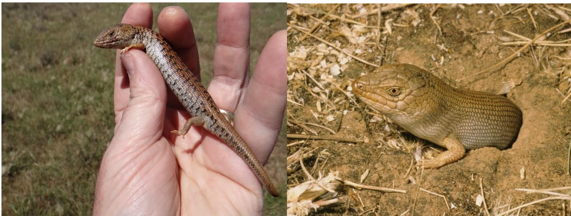
Adult male Pygmy Bluetongue, grassland habitat in the background

Pygmy Bluetongues are moderate-sized skinks, reaching a maximum snout-vent length (SVL) of 110 mm, and between 10g and 16g in mass. Females attain slightly higher body sizes than males (maximum male SVL 104 mm), are sexually mature at a snout-vent length of approximately 90 mm (85 mm in males; Hutchinson et al., 1994), and first breed at 2½ years of age during their third spring. Reproduction is viviparous. Following mating in November, birth of 1-4 (mode 3) young occurs in January-February. Their short-legged, elongate body form is correlated with their habits of utilising abandoned spider holes as retreat sites, especially those of large mygalomorphs (Milne & Bull, 2000; Fellows et al., 2007). The species is strongly diurnal, spending much of the day at the entrance to its spider-hole from which it can make short forays after prey (Pettigrew & Bull, 2014) with grasshoppers as the most important prey type (Fenner et al., 2007), and rapidly hide from potential predators (such as hovering hawks and elapid snakes).