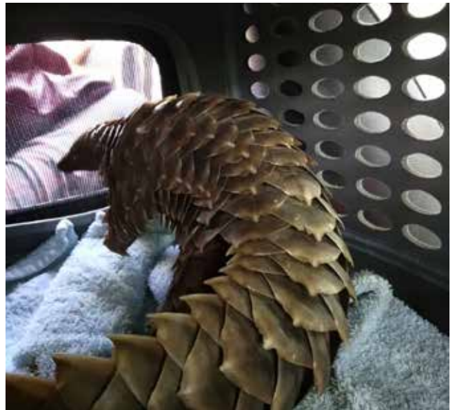
▲ Image 4: Temminck's pangolin being transported in a pet carrier lined with a towel.