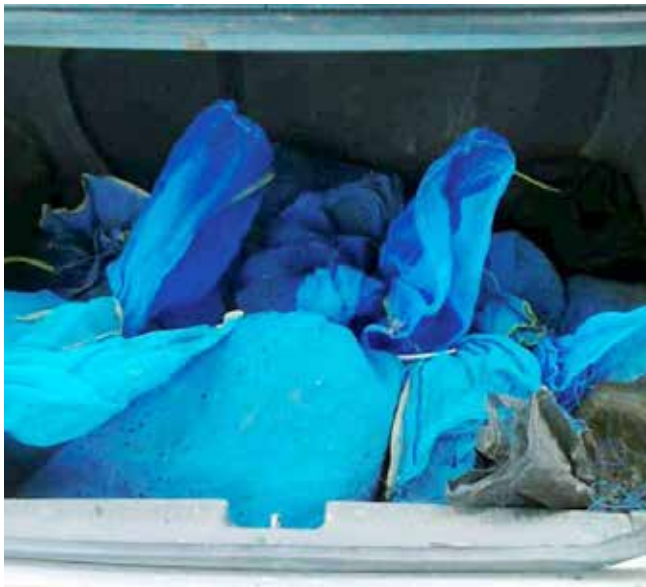
▲ Image 9: Pangolins confiscated in Malaysia in black and blue plastic sacks.