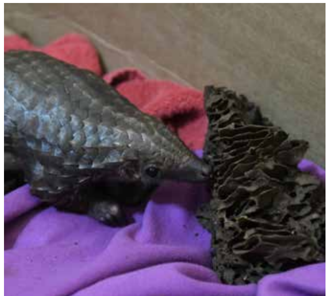
▲ Image 23: Juvenile white-bellied pangolin feeding from an ant nest.

To do this, always walk within two metres of the pangolin. If it is dark outside, bring a torch to illuminate the pangolin and its surroundings. Often a pangolin's natural response when being walked will be to hide in small spaces. Be aware of any holes, burrows or crevices between tree roots in the vicinity, as the pangolin, if healthy, may try to escape into these and will be difficult to recapture.