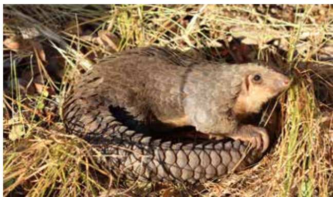
White-bellied pangolin ( Phataginus tricuspis ) 15