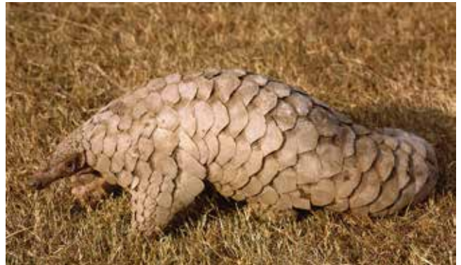
Indian pangolin ( Manis crassicaudata ) 10