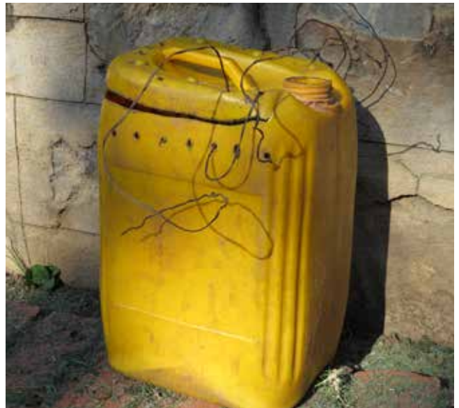
▲ Image 10: Plastic drum sewn shut with wire.

Furthermore, whilst rare, there have been instances in African countries where pangolins have been found with holes drilled in their scales and wire threaded through them, so they are unable to uncurl ( see Image 14 ). Cut the wire using wire cutters and very carefully remove it. If you do not have the correct tools available, wait for emergency care to arrive to avoid harming the pangolin whilst attempting to remove the wire.