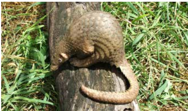
Philippine pangolin ( Manis culionensis ) 11