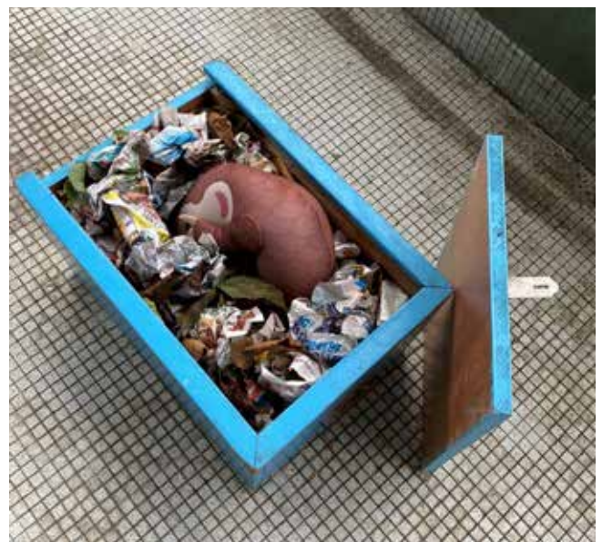
▲ Image 8: Wooden holding container with balls of newspaper for pangolins to roll and bury themselves in. Toy is used for demonstration.