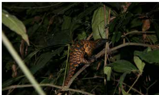
Black-bellied pangolin ( Phataginus tetradactyla ) 16