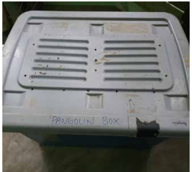
▲ Image 6: Plastic storage box with multiple small air holes.