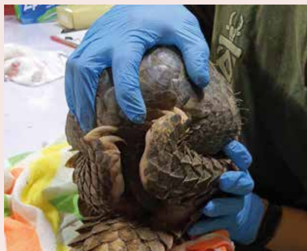
▲ Image 20: Partially curled up pangolin being carried using safe handling method.