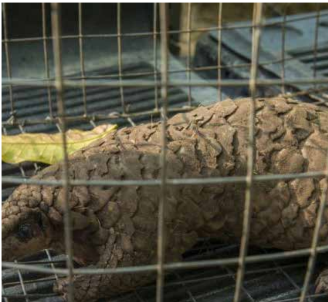
▲ Image 11: Sunda pangolin found in a wire cage in Sabah, Malaysia.

4. Cut away any restrictions binding the pangolin, such as wire or netting, using scissors or wire cutters, being careful not to hurt the pangolin ( Image 13 ).