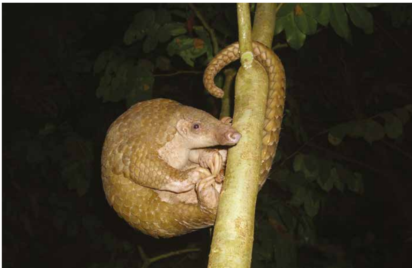
▲ Philippine pangolin ( Manis culionensis )

Part 2 of this guide outlines additional steps for first responders to care for pangolins and prevent deteriorating health if emergency care or transfer to a longer-term care facility will take more than two days and the pangolin must be held by the first responder in the short-term – likely a period of a few days to a week.