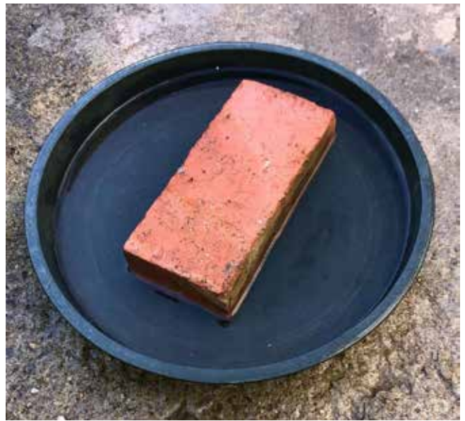
▲ Image 21: Water bowl weighed down by brick to prevent it from tipping over.

If the holding container is not large enough to contain the water bowl, place it just outside of the container and allow the pangolin regular access. Provide the pangolin with access to the water every 3-4 hours. The water should be replenished at this stage as well – see below for more information on checking on the pangolin.