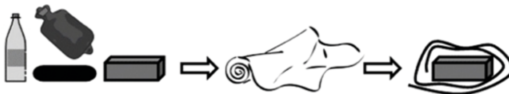
▼ Figure 1. Instructions for creating a heat source for the pangolin

If the safe space is particularly cold to a pangolin (i.e., less than 18°C/64°F), place an additional towel or blanket in the pangolin's holding container. If the space is particularly warm (more than 30°C/86°F), place the heat source further away from the pangolin, or provide extra ventilation such as a fan.