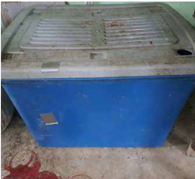
▲ Image 5: Plastic storage box with large airhole, suitable for temporarily keeping a pangolin.