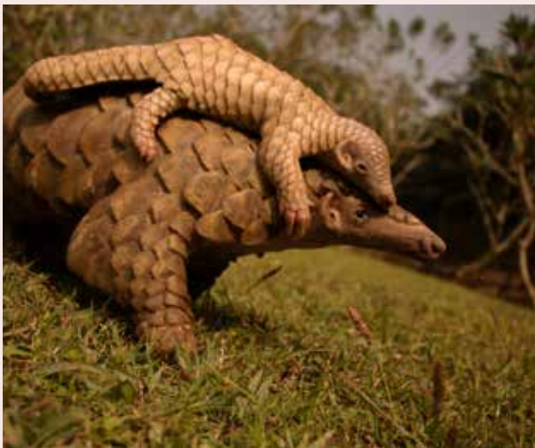
▲ Image 15: Infant Indian pangolin being carried on its mother's back.