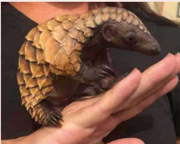
▲ Image 17: Infant black-bellied pangolin