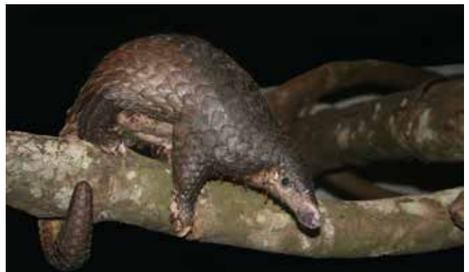
Sunda pangolin ( Manis javanica ) 12