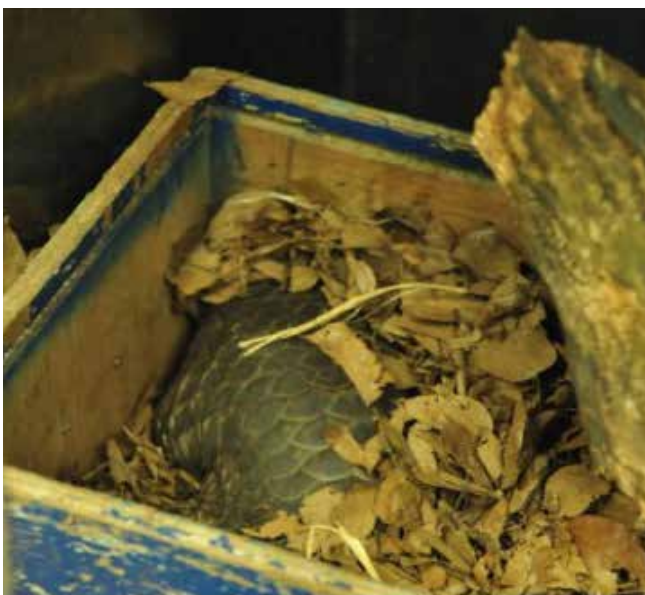
▲ Image 7: Wooden holding container with leaf litter for a Chinese pangolin to dig in and bury itself.

4. Ensure the opening to the holding container is secure. For example, once the pangolin is inside, secure the door with a lock or ties, or secure a lid by strapping the container shut. Be aware not to cover any air holes with straps and ties.