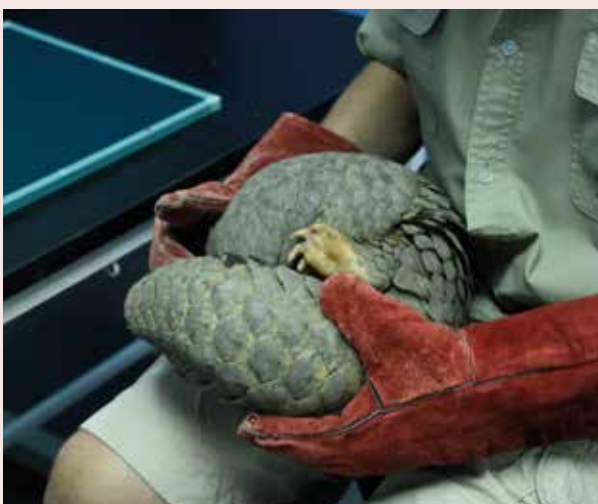
▲ Image 19: Curled up pangolin being carried using safe handling method.

Before moving the pangolin, ensure the place it is being transferred to (e.g. on the ground, in its holding container or on another surface) is safe. To do this, block any escape routes, remove any objects the pangolin might tightly curl up around, and ensure the surface is stable and away from any hazards (e.g. sharp objects, significant heights the pangolin might fall from).