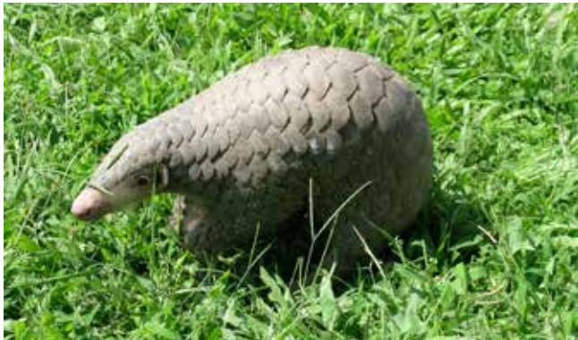
Chinese pangolin ( Manis pentadactyla ) 9