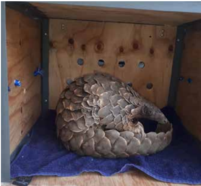
▲ Image 3: Wooden holding container with air holes and lined with a towel.

2. Ensure the holding container is well-ventilated by making air holes on the opening (i.e. the lid or door) and walls of the holding container see Images 5 and 6 and placing it near, but not directly next to, an open window, fan or air conditioning unit. Be aware that the pangolin may escape from an open window, so ensure the pangolin cannot reach or climb up to open windows should it break out of the holding container.