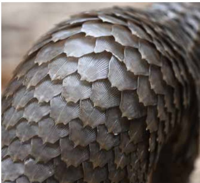
▲ Image 25: A white-bellied pangolin's scales with no hairs between scales.