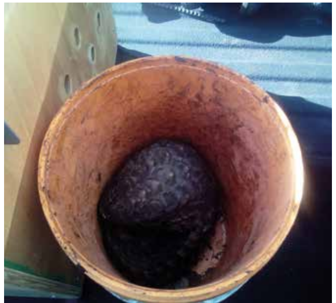
▲ Image 12: Temminck's pangolin found in plastic bucket.