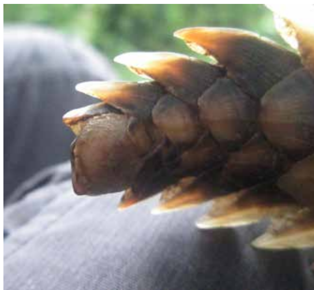
▲ Image 28: Close-up of the underside of a black-bellied pangolin's tail with pad at the tip of the tail.