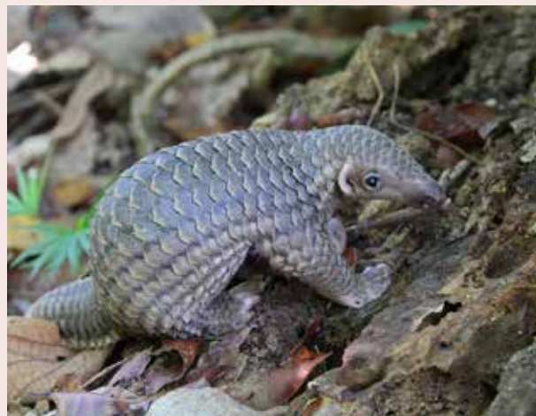
▲ Image 18: Juvenile Sunda pangolin; its scales have hardened.