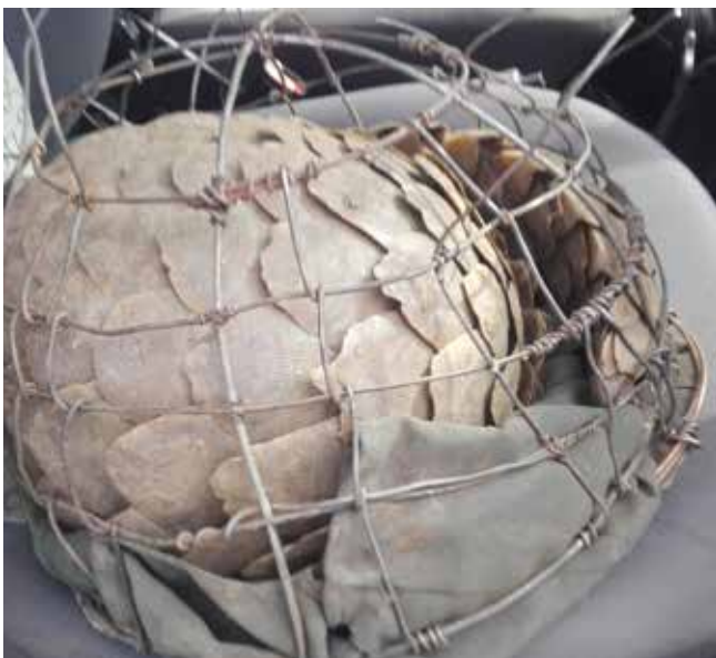
▲ Image 13: Temminck's pangolin confiscated in makeshift wire cage.