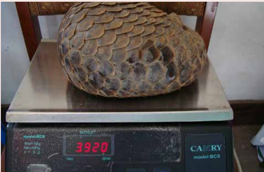
▲ Image 24: Chinese pangolin weighed on digital scale.

Record the pangolin's weight on the day of confiscation and subsequent days and compare the weight of the pangolin to the first weight recorded. If the pangolin's weight remains stable or increases, the pangolin's health is likely to be stable. If the pangolin's weight is decreasing, its health is likely deteriorating.