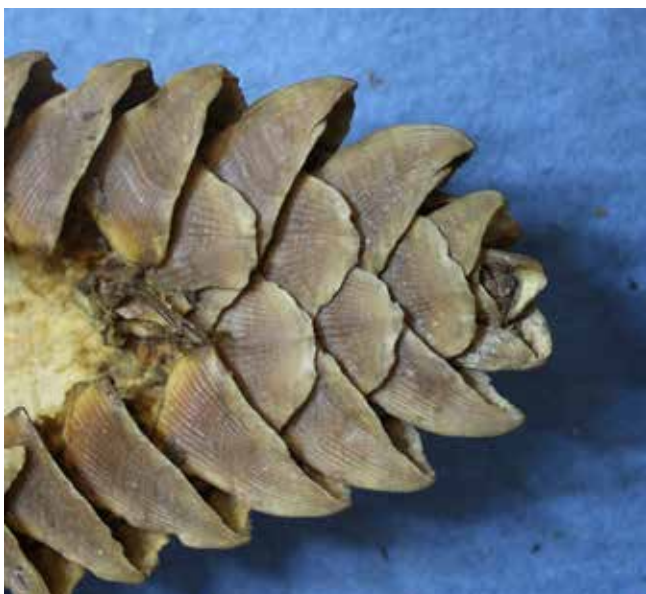
▲ Image 27: Close-up of the underside of a Temminck's pangolin tail with no tail pad at the tip of the tail.