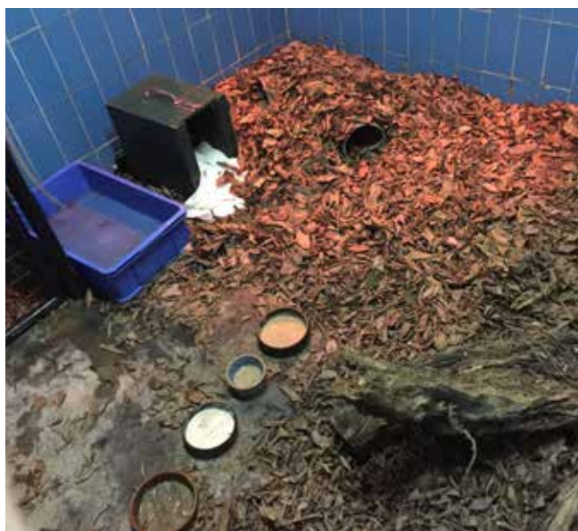
▲ Image 22: Typical safe space for longer-term captivity of pangolins.

Image 22 shows an example of a safe space for pangolins kept in longer-term care prior to release back into the wild. It is recognised that it may not be possible for the first responder to deliver this standard of care, but the safe space should aim to replicate this example, using the available resources.