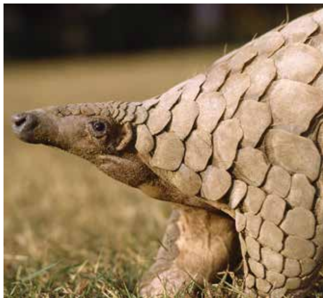
▲ Image 26: An Indian pangolin scales showing hairs between scales.