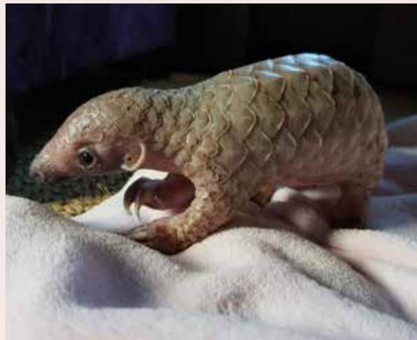
▲ Image 16: Infant pangolin, approximately 10 days old, with semi-transparent scales