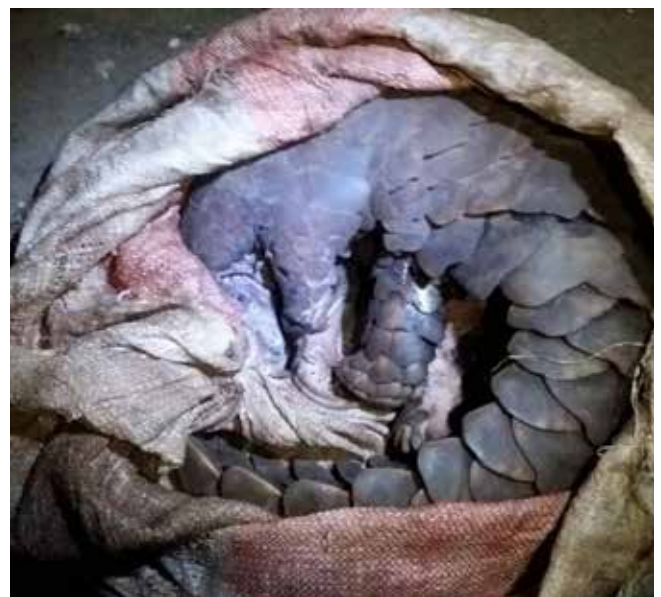
▲ Image 2: Pangolins trafficked in Africa and Asia are frequently constrained in nylon sacks.

If it is not possible to create individual holding containers for each pangolin, then temporarily housing more than one pangolin together is acceptable until a more suitable space can be found. However, the holding container should ideally be large enough so that both pangolins can stretch out and access water. See below for more information on creating a holding container.