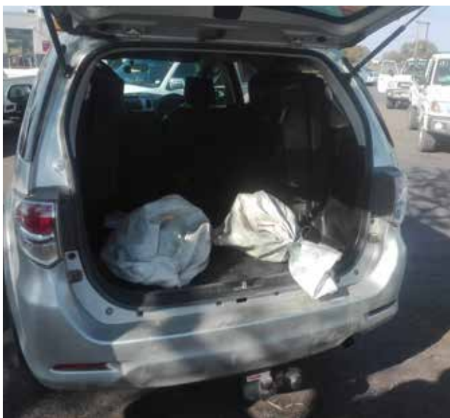
▲ Image 1: Trafficked pangolins are often found in tied up sacks in the backs of cars.

This section provides instructions on how to create a holding container. Key considerations include using material that the pangolin cannot break through, using a suitable substrate that the pangolin can hide and burrow in, and creating a structure that has air holes or vents and a solid lid. The pangolin can be held in this holding container for 1-2 days. However, it should be checked at least every 4 hours, given the opportunity to exercise if it appears to be in distress and be provided with water. Ideally, the holding container will be easily portable so the pangolin can be transported in it to a suitable care facility for longer-term care.