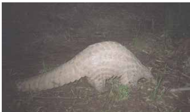
Giant pangolin ( Smutsia gigantea ) 13