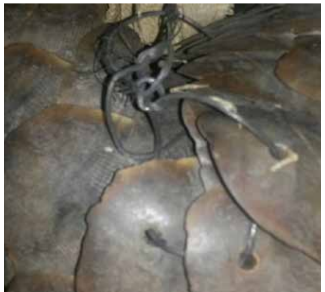
▲ Image 14: Wire threaded through a Temminck's pangolin's scales.