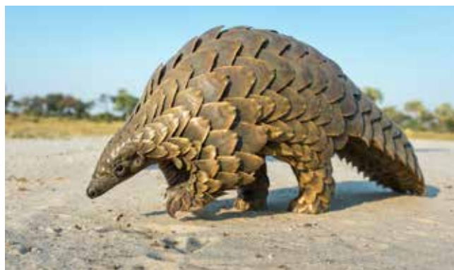
Temminck's pangolin ( Smutsia temminckii ) 14