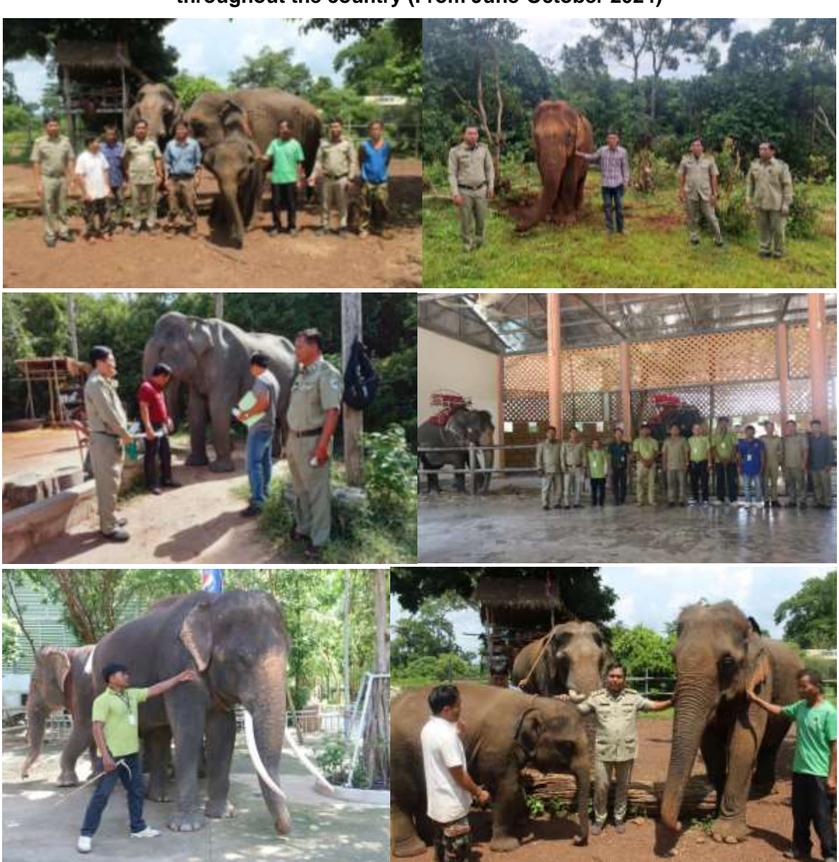
The Forestry Administration has conducted census of domesticated live elephant throughout the country (From June-October 2024)

The Forestry Administration conducted a series of NIAP-related activities to move forward the Cambodia's National Ivory Action Plan (NIAP) which include meetings, consultation, training workshops, and preparation of guidelines.