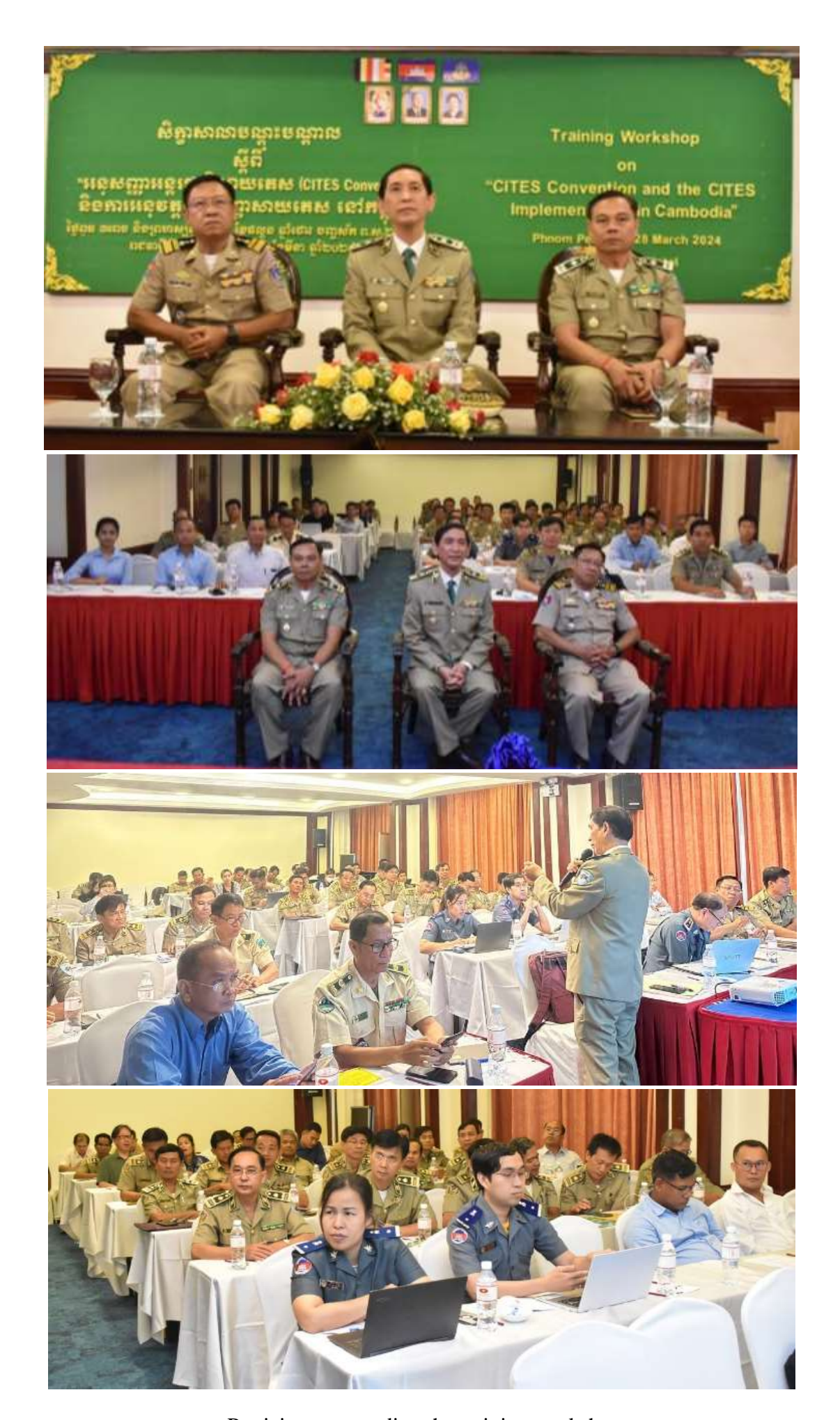
Participants attending the training workshop