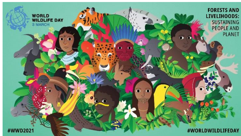
World Wildlife Day 2021 poster by Gabe Wong