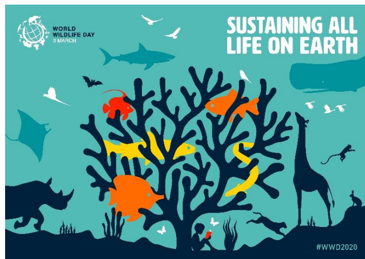
Poster for World Wildlife Day 2020 by Peter George