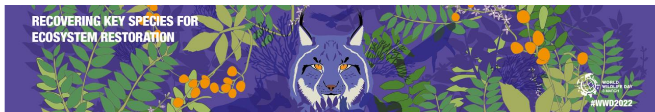
Main visual of WWD2022