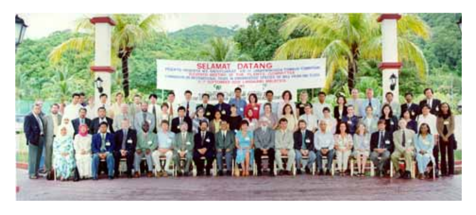
Group photograph of the participants in PC11

25. The 11th meeting of the Plants Committee (PC11) was held in Langkawi, Malaysia, from 3 to 7 September. The agenda, working documents and proceedings of this meeting can be viewed on the CITES website.