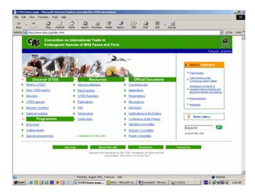
Homepage of the new website developed by the Secretariat

13. The Secretariat revamped its website and presented it at the 45th meeting of the Standing Committee (Paris, June 2001). The new website, developed and maintained directly by the Secretariat, was launched on 18 June 2001. The website is a major tool in the Secretariat's information strategy.