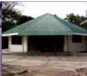
Water Filtration/ UV Light Treatment & Storage