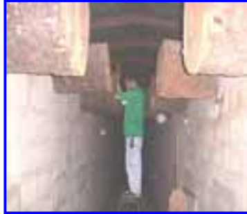
Nest Box-Breeding Aviary