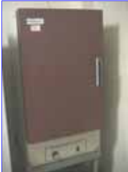
Mechanical Convection Incubator