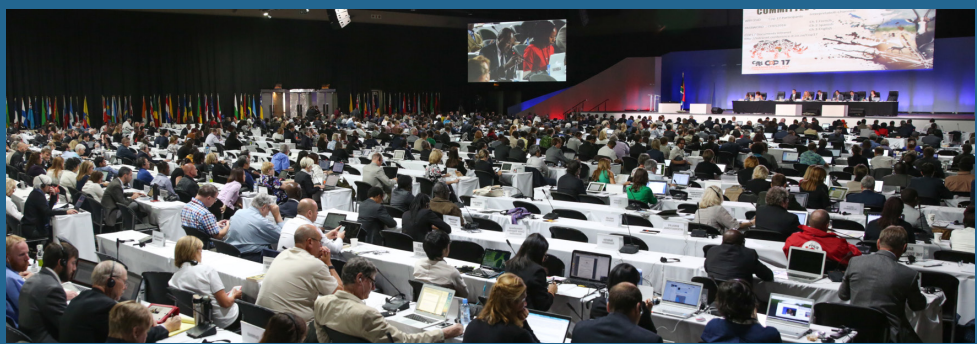
CITES CoP17 Johannesburg, October 2016

CITES regulates international trade in specimens of species of wild fauna and flora based on a system of permits and certificates issued under certain conditions. It covers export, re-export, import and landing from the high seas of live and dead animals and plants and their parts and derivatives.