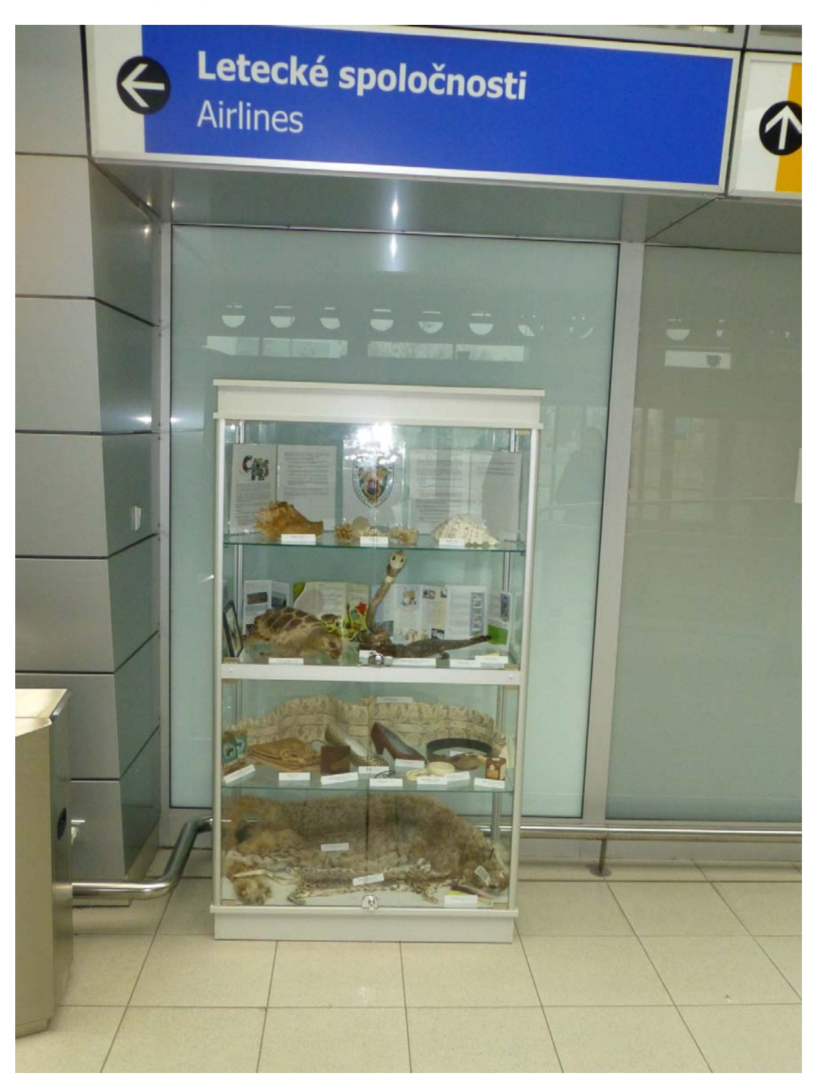
CITES information showcase at the Bratislava Airport