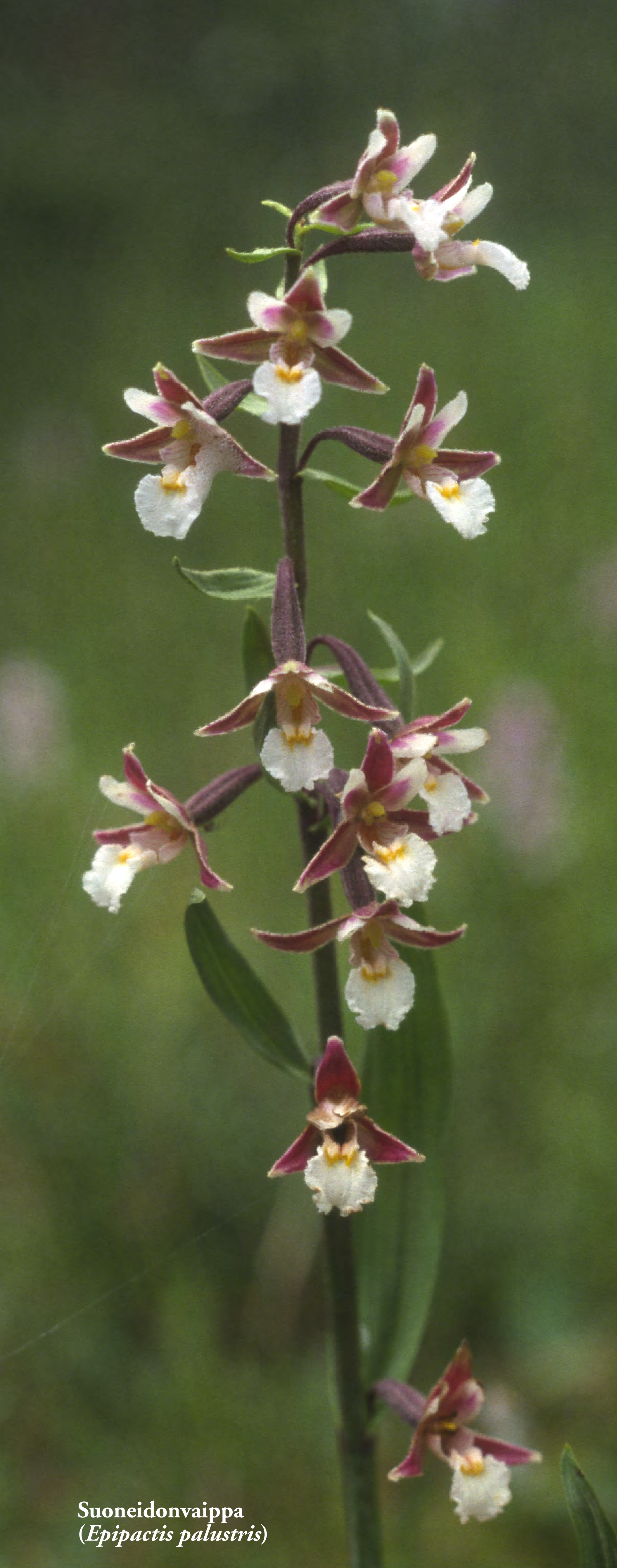
Suoneidonvaippa ( Epipactis palustris )