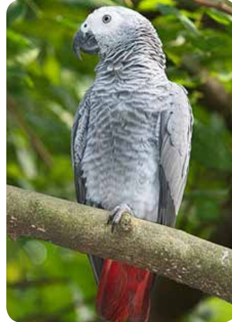
Harmaapapukaija

EU:n rajat ylittävän tuonnin ja viennin lisäksi unionin lainsäädäntö sääntelee myös yhteisön sisäistä uhanalaisten lajien kauppaa; sekä maiden välistä että sisäistä. Esimerkiksi A-liitteen lajeille vaaditaan erillinen EU-todistus ostoon, myyntiin ja muuhun kaupalliseen toimintaan.