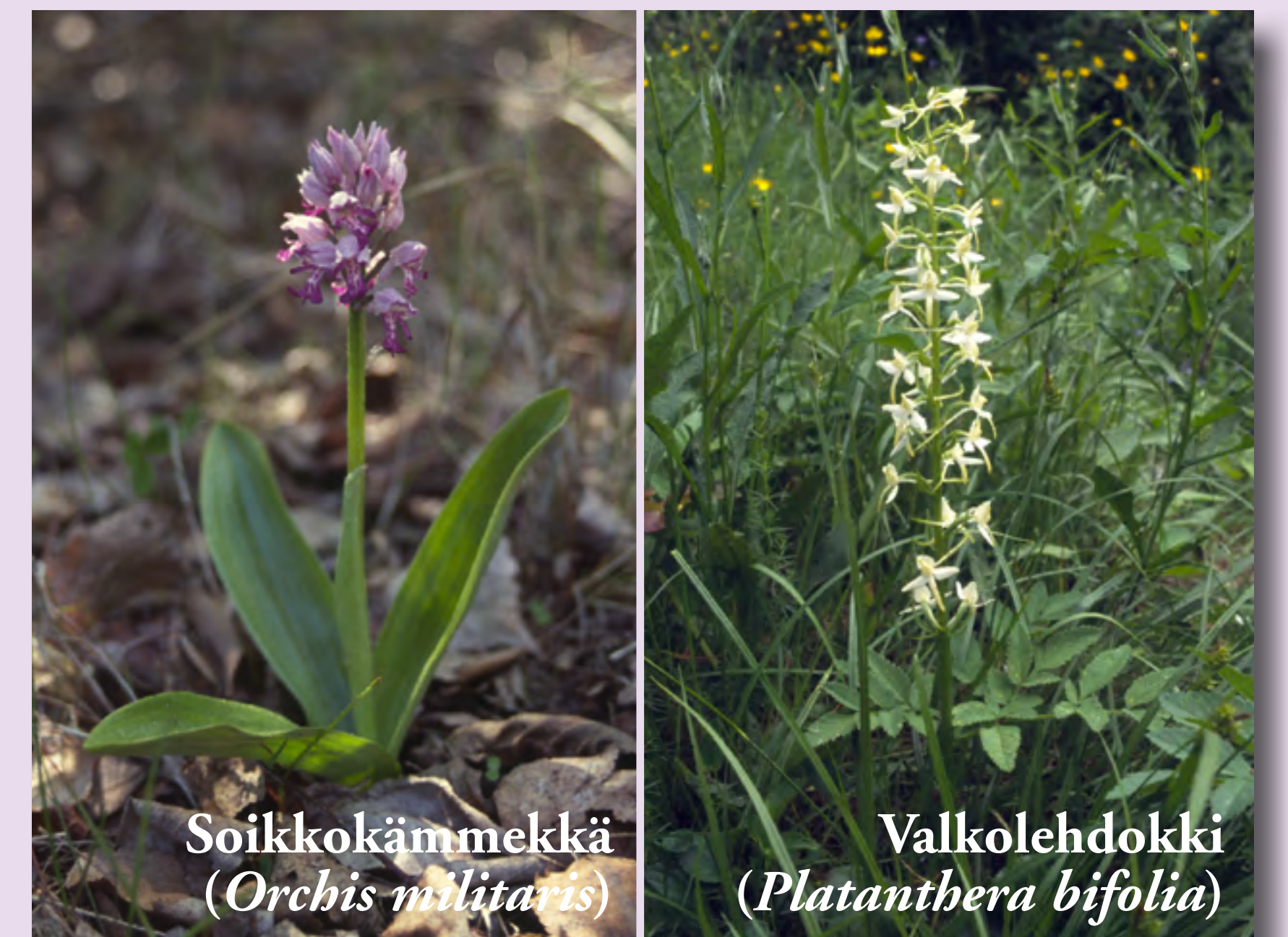
Soikkokämmekä ( Orchis militaris )