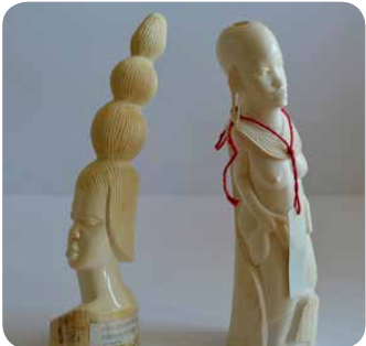
Norsunluuveistoksia, Trond Kvitvik