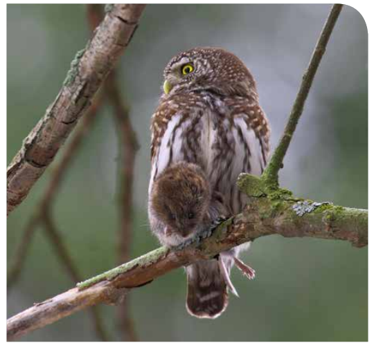
Varpuspöllö, Vesa Huttunen

Uhanalaisilla eläin- ja kasvilajeilla ei saa käydä kauppaa rajoituksetta. CITES-sopimus (Convention on International Trade in Endangered Species of Wild Flora and Fauna) suojelee luonnonvaraisia lajeja kansainvälisen kaupan haitallisilta seurauksilta.