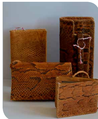
Pytonnahkaisia lompakoita, Trond Kvitvik

Sopimuksen tarkoitus on turvata uhanalaisia lajeja ja estää lajien uhanalaistuminen. Se ei kuitenkaan tarkoita täyskieltoa. Sopimuksen lajeista noin 2,5 prosenttia on sellaisia, joiden luonnonvaraisia yksilöitä ei voi tuoda tai viedä kaupallisesti.