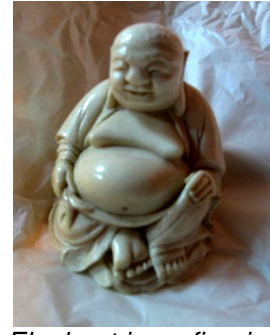
Elephant ivory figurine