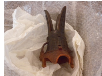
Rhinoceros horn cup

The Agri-Food and Veterinary Authority of Singapore (AVA) would like to remind all retail shop owners not to import, export, buy, display or sell parts and products made from wildlife of unknown or illegal origin.