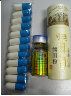
Bear bile powder