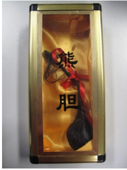
Bear gall bladder