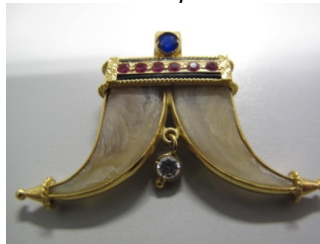
Tiger nail pendant