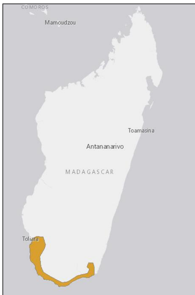
Figure 1: Distribution of Paroedura androyensis (in orange) (Madagasikara Voakajy, 2011)

Paroedura androyensis is regionally endemic to southern (D’Cruze et al. , 2009), south-western (Raselimanana et al. , 2012) and south-eastern (Welch, 1982) Madagascar (Figure 1). It occurs in scattered locations, including: Andrahomana, Cap Sainte Marie, Isaka-Ivondro, Miary, Sarodrano, Tolagnaro, Tsivanoa, Zombitse Forest (Glaw and Vences, 2007), Malahelo, Petriky, (Ramanamanjato et al. , 2002; Glaw and Vences, 2007), Isalo (Hawkins, 1994, in: Rakotondravony and Goodman, 2011), Salary-Bekodoy (Raselimanana et al. , 2012), Andohahela (Nussbaum et al. , 1999), and the Ifotaka North Protected Area (Theisinger and Ratianarivo, 2015). The species was reported to be severely fragmented over its range, with an estimated extent of occurrence of 17,970 km 2 (Rabibisoa et al. , 2011).