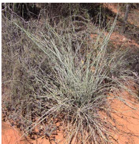
Photo 1: Adenia subsessifolia , adult specimen on the Toliara plateau