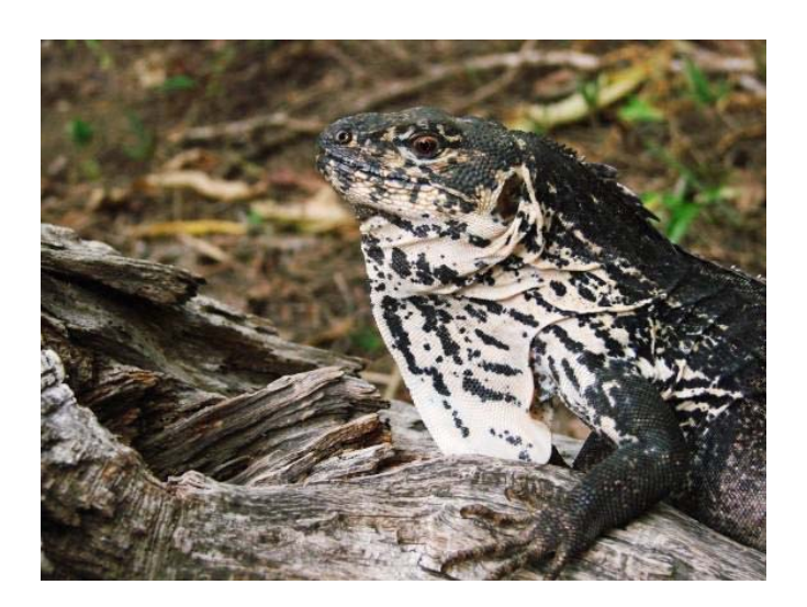
Figure 2. Guatemalan spiny-tailed iguana, Ctenosaura palearis

Adults are silver grey, brown, grey, or bluish. They have several dark bands across the dorsal surface of the body, usually with pale colouring along the middle of the back. Arms and legs and the posterior part of the body have black blotches or bands, and the ventral surface is pale grey to whitish or cream in the central area (Köhler, 2003; Campbell, 1998). In the breeding season, the colours of males change: their head becomes orangey or reddish or orangey blotches appear on their dorsal surface (Lee, 2000).