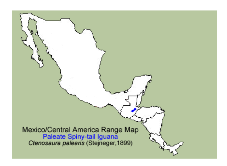
Figure 1. Range map of the Guatemalan spiny-tailed iguana, Ctenosaura palearis