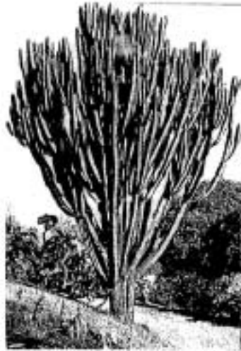
Fig. 2. E. candelabrum and its habitat in the wild