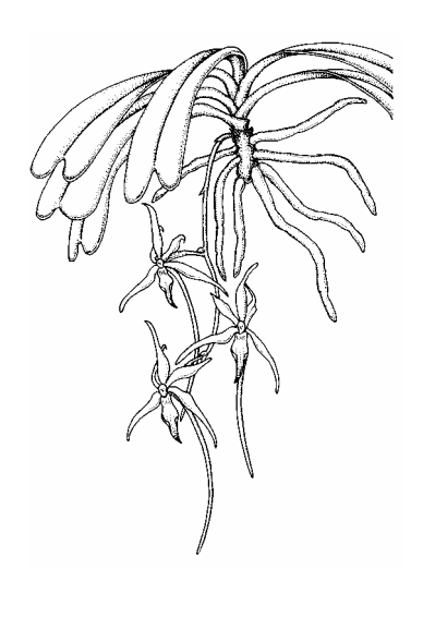
Angraecum sp.

27. All of the statistics in annual reports of the Parties submitted in accordance with Article VIII, paragraph 7(a), are entered into the CITES trade database. The UNEP World Conservation Monitoring Centre (UNEP-WCMC) in Cambridge, United Kingdom, does this work under a consultancy contract with the Secretariat. In 2000, a total of 479,248 trade records were entered into the database. The consistency of all data entered in the database is automatically checked and UNEP-WCMC contacts Parties directly on behalf of the Secretariat when it discovers discrepancies or anomalies. The taxonomic files behind the database are updated regularly in line with the most recently accepted nomenclature and currently contain over 39,000 taxon names, including synonyms. Considerable revision of the Boidae, Chamaeleonidae, Scleractinia and Orchidaceae was carried out during 2000.