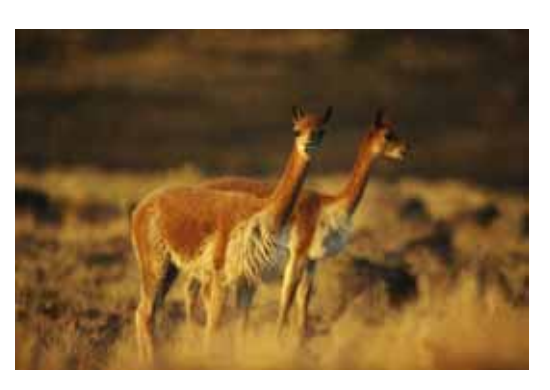
Vicuñas ( Vicugna vicugna ) in the wild.