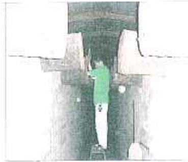
Nest Box-Outside View(Alley)