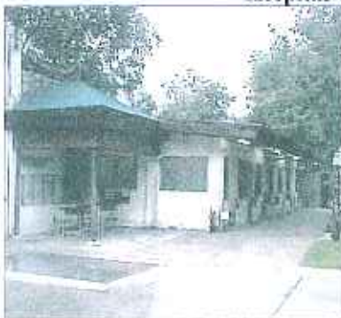
Hospital I & II