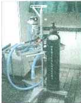
Mobile Gas-Anesthesia machine