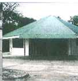
Water Filtration/ UV Light Treatment & Storage