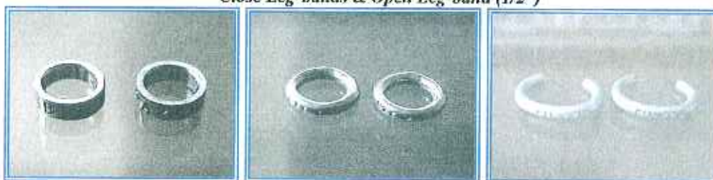
Close Leg-bands & Open Leg-band (1/2")

An open stainless steel leg-band is attached additionally to a female captive bred-progeny after surgical sexing. This will clearly identify the surgically sexed female because it is fitted with two leg-bands, a closed band on the right foot and an open band on the left.