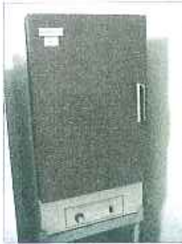
Mechanical Convection Incubator