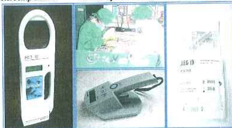
Microchip Reader Microchip Installation Microchip Implant